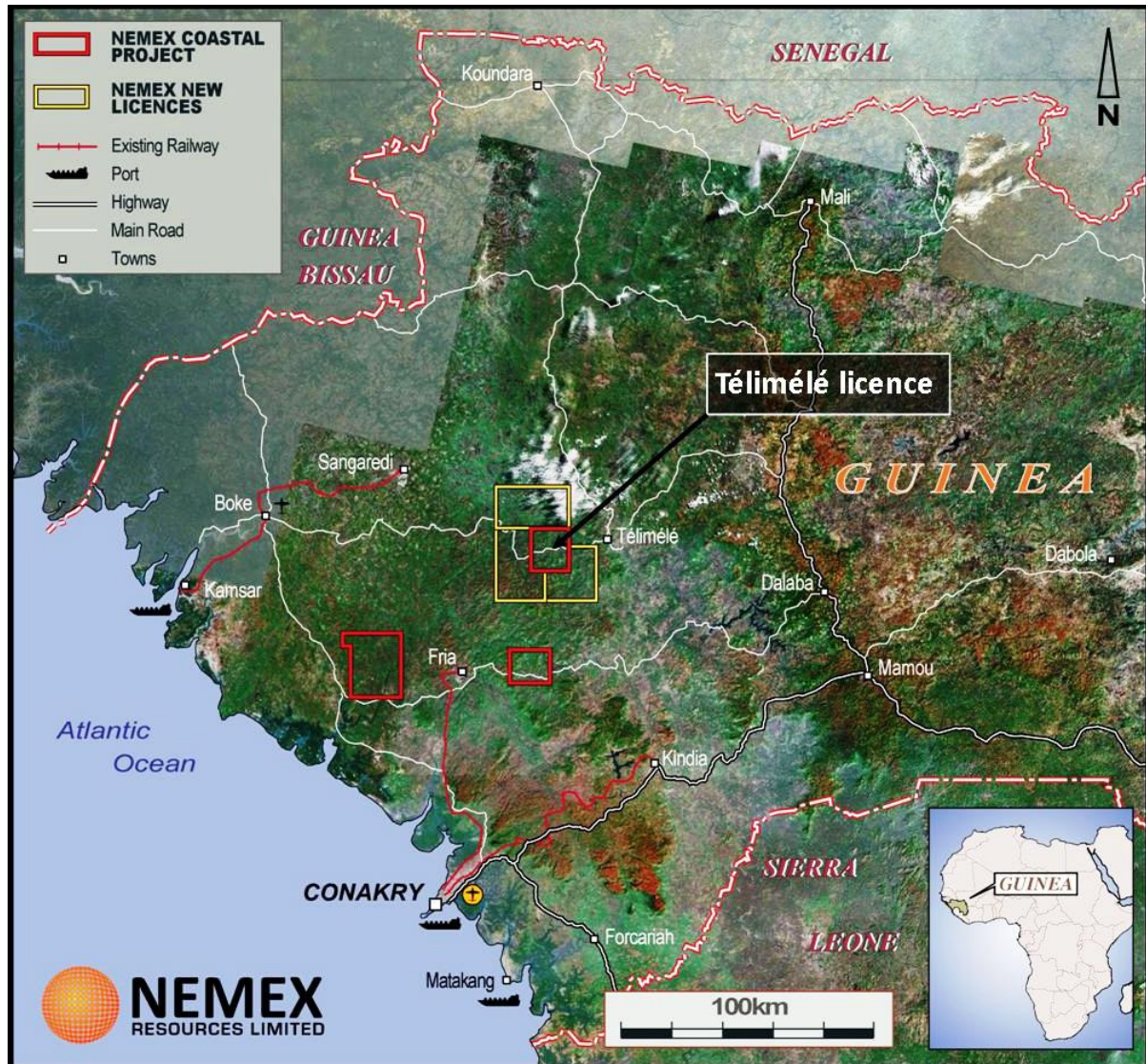
Figure 1. Regional location of Nemex's Coastal Iron Project (red outlines), including the Téliimélé licence area and new exploration licence applications (yellow outlines) in western Guinea.